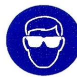
Wear Hearing & Eye Protection