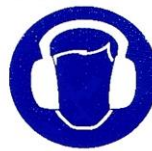
Wear Hearing & Eye Protection