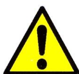
High Pressure Water